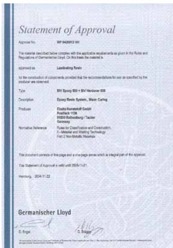
GL-approval as boatbuilding resins for BIV Epoxy 800 and BLH Epoxy 200