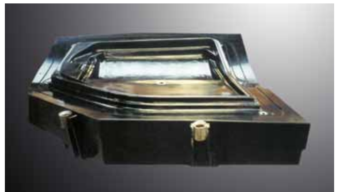
RTM mould of ebalta epoxy resin