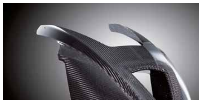
Motorcycle cladding part