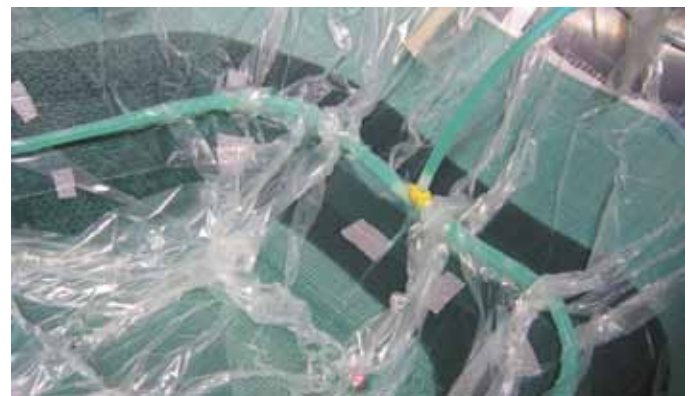
Infusion resin flow