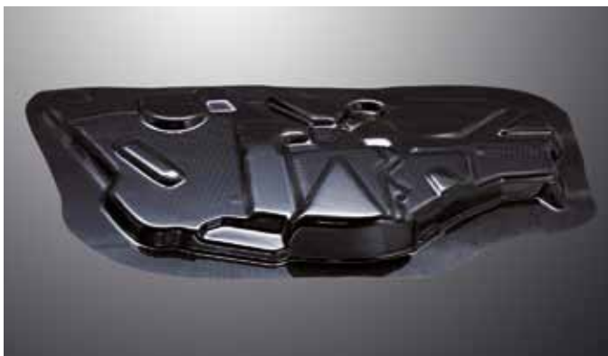
CF component produced using ebalta epoxy resin